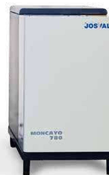
MONCAYO 780 -AS-