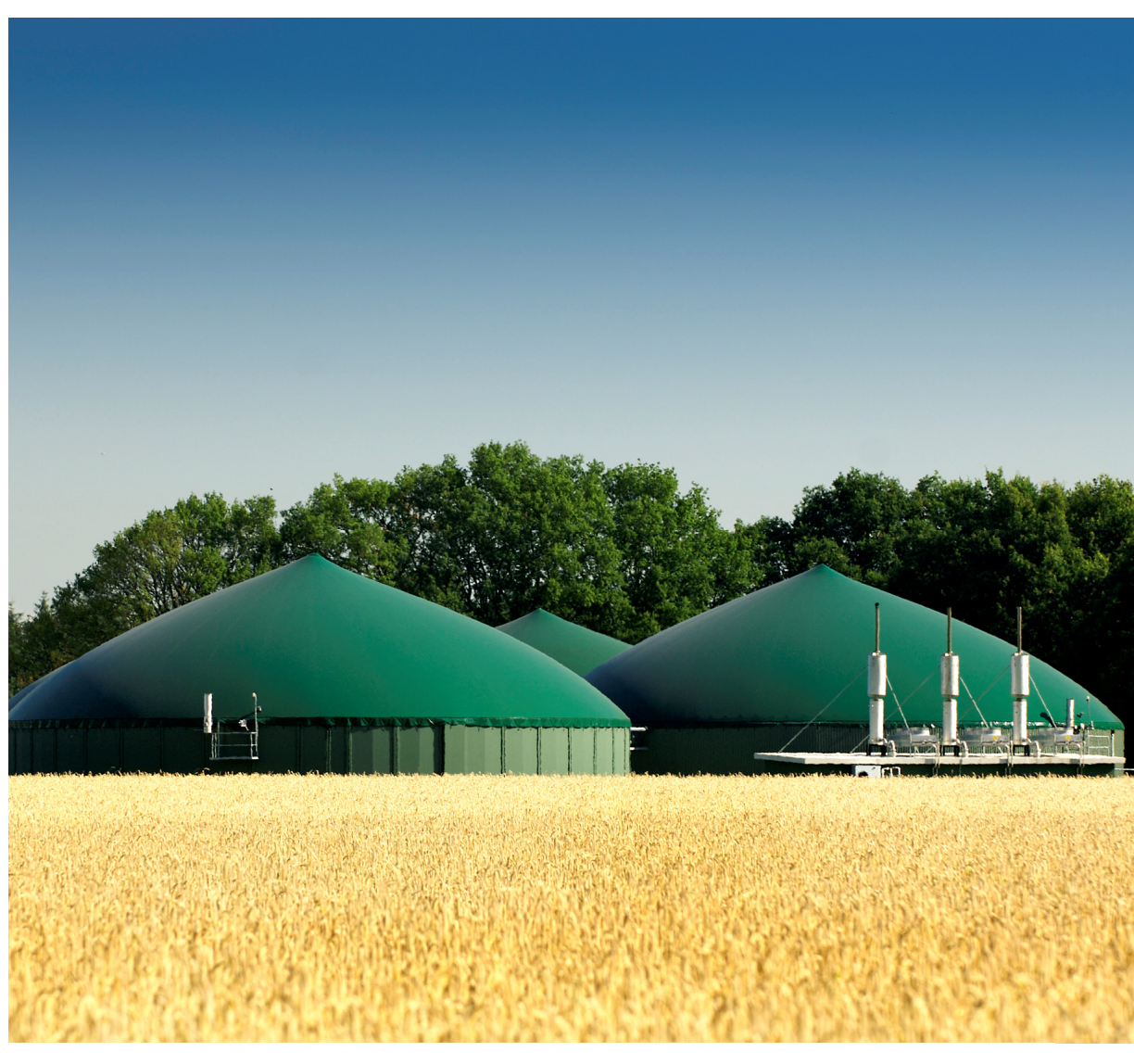
By working in partnership with Adicomp to secure your future

Capacity up to 3000Nm<sup>3</sup>/h Available discharge pressures from 3.5bar(g) to 25bar(g) Nominal power from 4.0 to 400kW